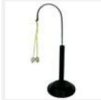
Model: ES35050 Name: Electroscope Pith Ball