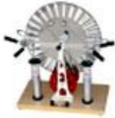
Model: ES35110 Name: Wimshurst Machine