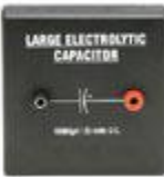
Model: ES35083 Name: Large Electrolytic Capacitor