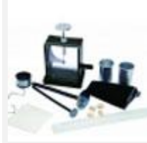
Model: ES35055 Name: Electrostatics Kit