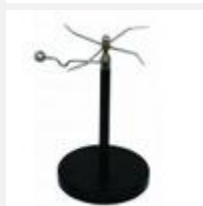
Model: ES35040 Name: Electrical Whirl