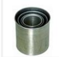
Model: ES35060 Name: Faraday Ice Pails