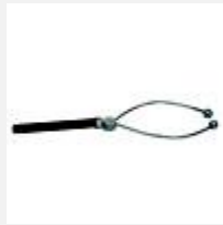
Model: ES35030 Name: Discharger