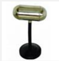
Model: ES35025 Name: Cylindrical Conductor