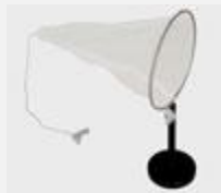
Model: ES35015 Name: Butterfly Net Faraday