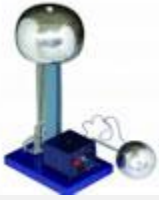
Model: ES35105 Name: Van De Graff Generator (Motor Driven)