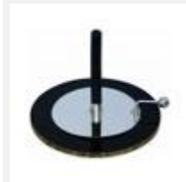
Model: ES35045 Name: Electrophorus