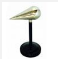
Model: ES35020 Name: Conical Cylinder