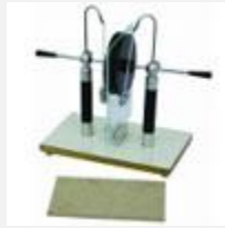
Model: ES35010 Name: Aepinus Condenser