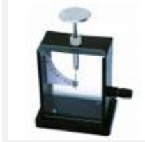
Model: ES35075 Name: Gold Leaf Electroscope Dual Purpose