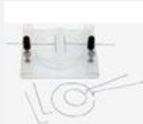
Model: ES35035 Name: Electric Fields Apparatus