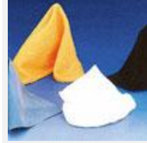
Model: ES35065 Name: Friction Cloths Set