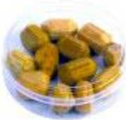
Model: ES35090 Name: Pith Balls