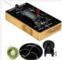
Model: ES25025 Name: Melde's Apparatus