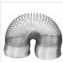
Model: ES25090 Name: Wave Form Helix (Slinky)