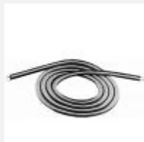
Model: ES25085 Name: Wave Form Helix