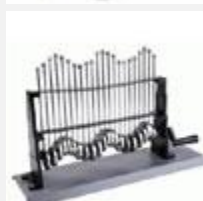
Model: ES25035 Name: Powell's Machine