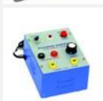
Model: ES25045 Name: Ripple Tank Controller