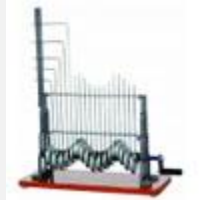
Model: ES25095 Name: Longitudinal and Transverse Motion Apparatus