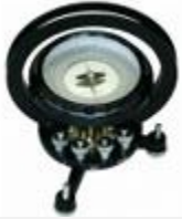
Model: ES30285 Name: Tangent Galvanometer