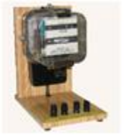
Model: ES30168 Name: Joule Meter Mounted