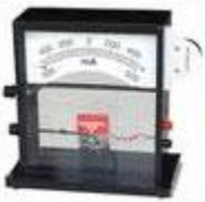
Model: ES30076 Name: Demonstration Meter Interchangeable Scale