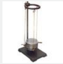
Model: ES15128 Name: Lee's Disc Conductivity Apparatus