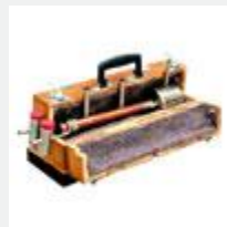
Model: ES15159 Name: Searle's Thermal Conductivity of Copper Apparatus