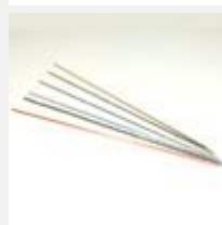
Model: ES15195 Name: Thermal Conductivity Rods