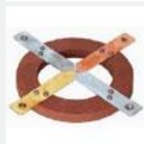
Model: ES15194 Name: Thermal Conductivity of Metals