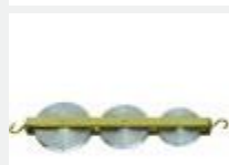
Model: ES10245 Name: Pulley Triple Tandem Metal