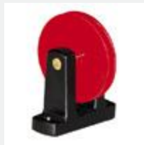
Model: ES10215 Name: Pulley Board Mounting