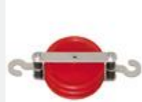
Model: ES10241 Name: Pulley Triple Parallel Plastic