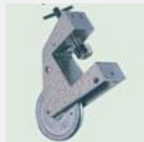
Model: ES10247 Name: Pulley Vertical Plane