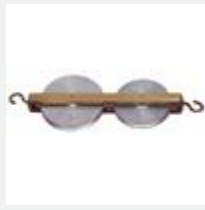
Model: ES10218 Name: Pulley Double Tandem Metal