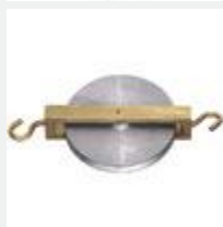
Model: ES10237 Name: Pulley Single Metal