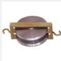
Model: ES10216 Name: Pulley Double Parallel Metal