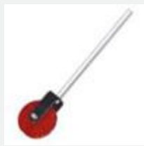
Model: ES10225 Name: Pulley On Rod