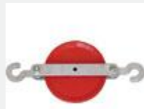
Model: ES10238 Name: Pulley Single Plastic