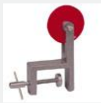
Model: ES10228 Name: Pulley Plain Bearing Aluminum