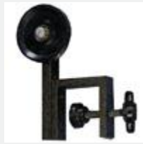
Model: ES10212 Name: Pulley Bench Clamp