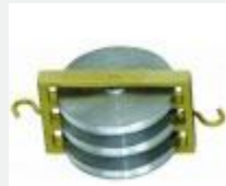
Model: ES10240 Name: Pulley Triple Parallel Metal