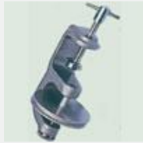
Model: ES10220 Name: Pulley Horizontal Plane