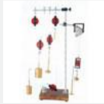
Model: ES10211 Name: Pulley All System (Demo)