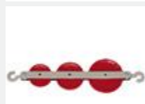
Model: ES10246 Name: Pulley Triple Tandem Plastic