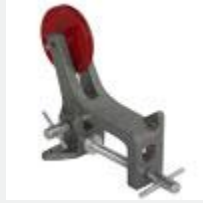
Model: ES10210 Name: Pulley All Purpose