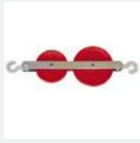
Model: ES10219 Name: Pulley Double Tandem Plastic