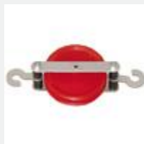
Model: ES10217 Name: Pulley Double Parallel Plastic