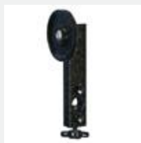
Model: ES10233 Name: Pulley Rod Mounting