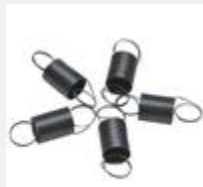
Model: ES10097-3 Name: Springs Steel Extension Type 3