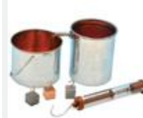
Model: ES10257 Name: Specific Gravity Set