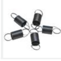
Model: ES10097-2 Name: Springs Steel Extension Type 2