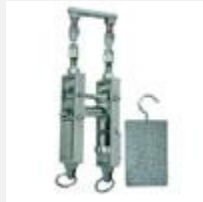
Model: ES10315 Name: Young's Modulus Apparatus (Searle's Pattern)