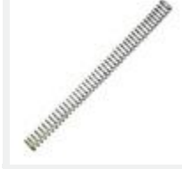
Model: ES10085 Name: Springs Steel Compression