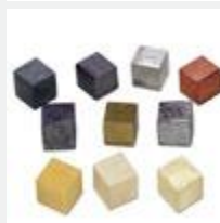
Model: ES10015 Name: Cubes for Density Investigation Set of 10