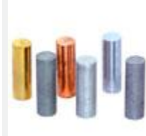
Model: ES15175 Name: Specific Heat Specimen Set (Equal Size)