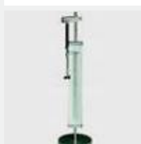
Model: ES10135 Name: Hooke's Law Apparatus