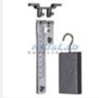
Model: ES10310 Name: Young's Modulus Apparatus