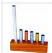
Model: ES15170 Name: Specific Heat Specimen Set (Equal Mass)