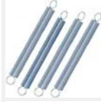
Model: ES10090C Name: Springs Steel Extension 225mm Long