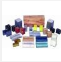
Model: ES10016 Name: Assorted Materials Kit