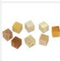
Model: ES10305 Name: Cubes Wooden 20mm Assorted Set of 8