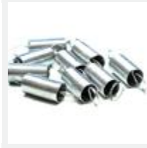
Model: ES10093 Name: Springs Steel Expandable Long Extension