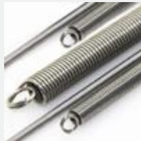
Model: ES10086C Name: Springs Steel Heavy 200mm