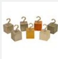
Model: ES10014 Name: Cubes for Density Investigation Hooked Set of 6