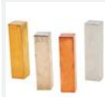
Model: ES10017 Name: Specific Gravity Metal Blocks Set of 4