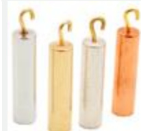
Model: ES10018 Name: Specific Gravity Metal Cylinders Set of 4