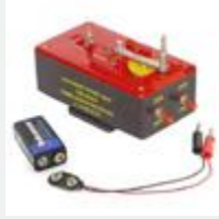
Model: ES10280 Name: DC Ticker Timer (Dual Speed)