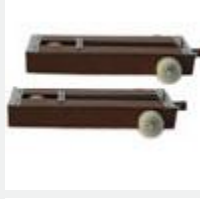
Model: ES10080 Name: Dynamic Trolley Pair Wooden