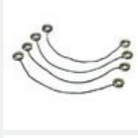
Model: ES10082 Name: Elastic Cord with Eyelets Pack of 10