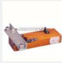
Model: ES10095 Name: Falling Body Apparatus