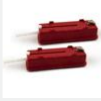
Model: ES10081 Name: Dynamic Trolley Pair ABS