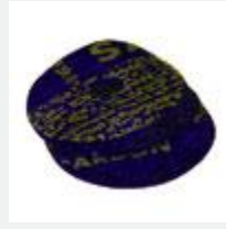
Model: ES10277 Name: Ticker Tape Carbons Pack of 100