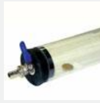
Model: ES10110 Name: Free Fall in Vacuum (Guinea and Feather)