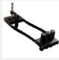
Model: ES10155 Name: Inertia Balance Kit