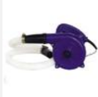
Model: ES10011 Name: Air Blower Economy