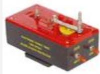
Model: ES10281 Name: AC Ticker Timer (Dual Speed)