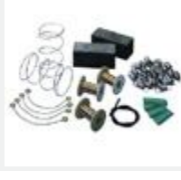
Model: ES10083 Name: Elastic Material Kit