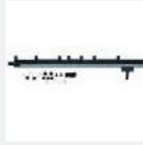
Model: ES10170 Name: Linear Air Track Kit