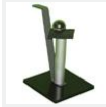
Model: ES100110 Name: Inertia Balance Simple