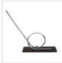
Model: ES100114 Name: Loop the Loop