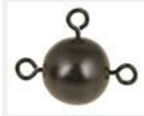
Model: ES100112 Name: Inertia Ball with 3 Eye Bolts