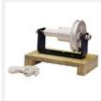
Model: ES100116 Name: Wheel and Axle Compound