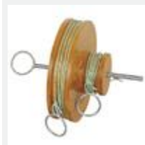
Model: ES100118 Name: Wheel and Axle Simple