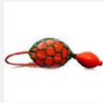
Model: ES99125 Name: Rubber Bellow with Cotton Net