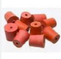
Model: ES99116 Name: Natural Rubber Single Hole Stoppers