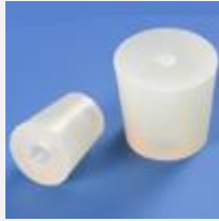
Model: ES99101 Name: Silicon Stopper All Sizes