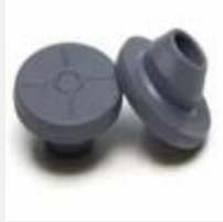
Model: ES99103 Name: Butyl Stoppers All Sizes