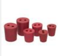
Model: ES99117 Name: Natural Rubber Double Hole Stoppers