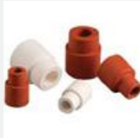
Model: ES99106 Name: Turn Over Flanges for Tubes All Sizes