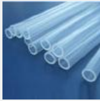
Model: ES99108 Name: Silicon Tubing All Sizes