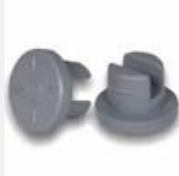
Model: ES99104 Name: Butyl Lyo Stoppers All Sizes