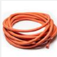
Model: ES99107 Name: Rubber Tubing all Colours All Sizes