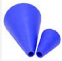
Model: ES99102 Name: Rubber Filtration Cones All Sizes