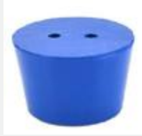
Model: ES99109 Name: Silicon Stoppers for Filtration Flasks