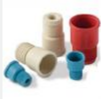
Model: ES99105 Name: Turn Over Flanges for Sockets All Sizes