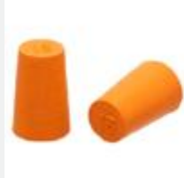
Model: ES99115 Name: Natural Rubber Solid Stoppers