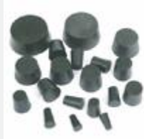
Model: ES99118 Name: ASTM Stoppers All Sizes All Types