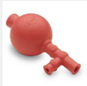
Model: ES99129 Name: Cork Stoppers Various Sizes