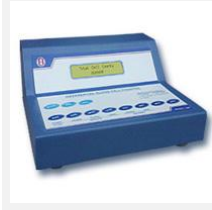
Model: ES59906 Name: Digital Differential Cell Counter