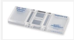
Model: ES59908 Name: Counting Chambers