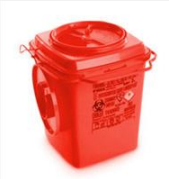
Model: ES89125 Name: Sharp Container