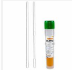
Model: ES59915 Name: Universal Transport Medium Kit (UTM)