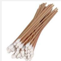
Model: ES59902 Name: Cotton Swabs