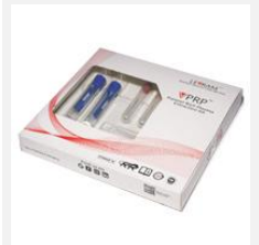
Model: ES59918 Name: PRP Kits