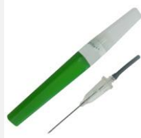
Model: ES59901 Name: Blood Collection Needles