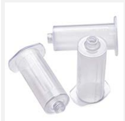
Model: ES59909 Name: Needle Holders