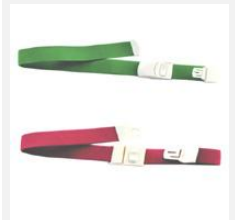
Model: ES59961 Name: Tourniquets