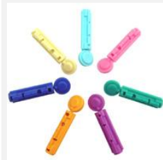
Model: ES59986 Name: Safety Lancets Twist Off