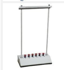
Model: ES59971 Name: ESR Wetergreen Pipette Stand Six Place