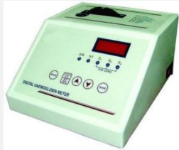
Model: ES59961 Name: Digital Haemometer