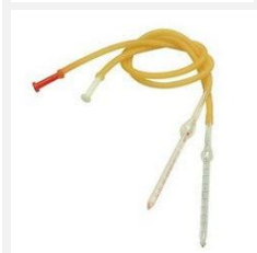
Model: ES59962 Name: RBC Pipettes