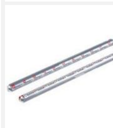
Model: ES59963 Name: Wintrobe Tubes