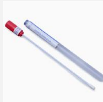
Model: ES59903 Name: Cotton Swabs Sterile with Transportation Tube