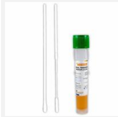
Model: ES59914 Name: Viral Transport Medium Kit (VTM)