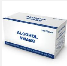
Model: ES59900 Name: Alcohol Swabs