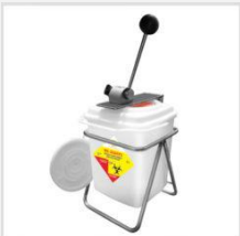
Model: ES89129 Name: Needle Syringe Hub Destroyer