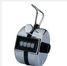
Model: ES59904 Name: Hand Tally Counter