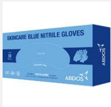
Model: ES89118 Name: Blue Nitrile Gloves - 9.5 inches length