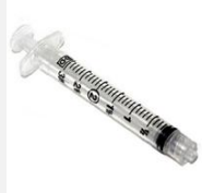
Model: ES59898 Name: Syringe Hypodermic, Disposable, All Sizes