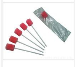
Model: ES59911 Name: Oral Swabs