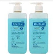
Model: ES89120 Name: Pure Ethanol Hand Sanitizer