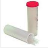
Model: ES59895 Name: Haematocrit Capillary Tubes