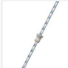
Model: ES59970 Name: ESR Wetergreen Pipette