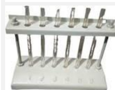
Model: ES59964 Name: Wintrobe Tube Stand Six Place