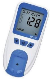
Model: ES59992 Name: Digital Haemometer