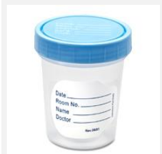
Model: ES59992 Name: Universal Sample Container