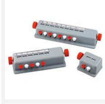
Model: ES59907 Name: Manual Differential Cell Counters