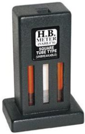
Model: ES59990 Name: AI-Haemometer/Haemoglobinometer/H.B. Meter Sahli Round