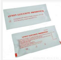
Model: ES59935 Name: Lemon Glycerin Swabs