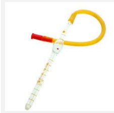
Model: ES59963 Name: WBC Pipettes