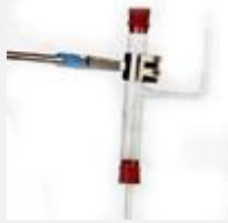
Model: ES60101 Name: Potometer Darwin's