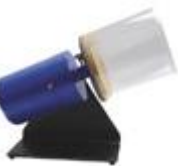
Model: ES60032 Name: Clinostat Electric