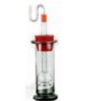
Model: ES60095 Name: Osmosis Apparatus