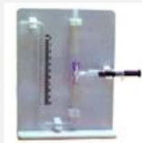
Model: ES60100 Name: Potometer