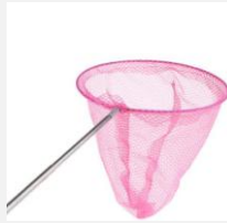
Model: ES60003 Name: Insect and Larva Collecting Net with Aluminium Handle