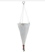
Model: ES60012 Name: Plankton Collection Net Vial & 2 Collection Bottles