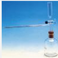
Model: ES60102 Name: Potometer Farmer's