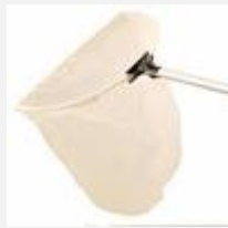
Model: ES60002 Name: Aquatic Net