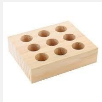
Model: ES60008 Name: Wooden Entomology Pin Storage Block, 6 Holes for Various Pins