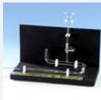
Model: ES60104 Name: Potometer Thoday's