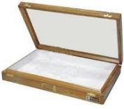
Model: ES60009 Name: Insect Storage Box - Polished Wood