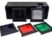
Model: ES60011 Name: Combination-Dark-Chamber