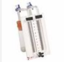
Model: ES60098 Name: Respirometer Simple