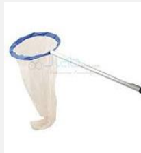
Model: ES60005 Name: Insect Collecting Net with Aluminium Handle