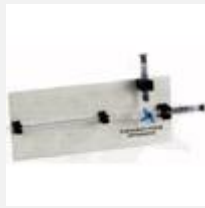
Model: ES60098 Name: Photosynthesis Apparatus