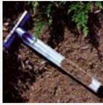
Model: ES60135 Name: Soil Sampling Tube (Metal)