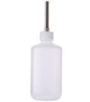
Model: ES60031 Name: Animal Water Feeding Bottle