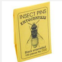
Model: ES60006 Name: Insect Entomology Dissection Pins All Sizes