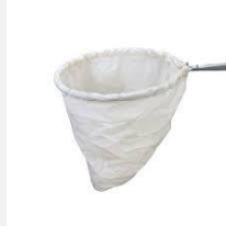
Model: ES60004 Name: Insect and Larva Collecting Net with Aluminium Handle